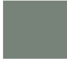
Dover Gray (solid top only)