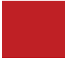
Bright Red (solid top only)