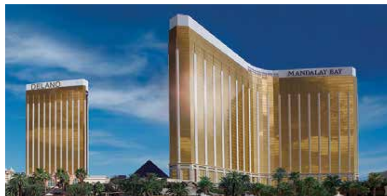
Architects around the world specify Kynar 500™ resin based coatings because of its ability to withstand the rigors of nature and time. This high performance coating system has an extraordinary capability to retain color and gloss, and keeps painted metal looking vibrant and appealing for years to come.